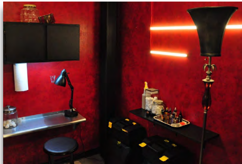
BLACK INK CREW