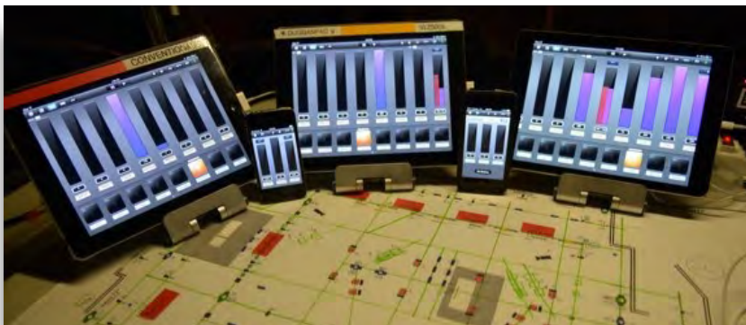
FULLY AUTOMATED WIRELESS LIGHTING DEVELOPED BY DUGGAN

VH1 Multi-network Food Network FYI TLC VH1 SyFy syndicated VH1 Food Network Food Network HGTV Food Network Food Network Food Network Food Network Food Network MTV Food Network TLC