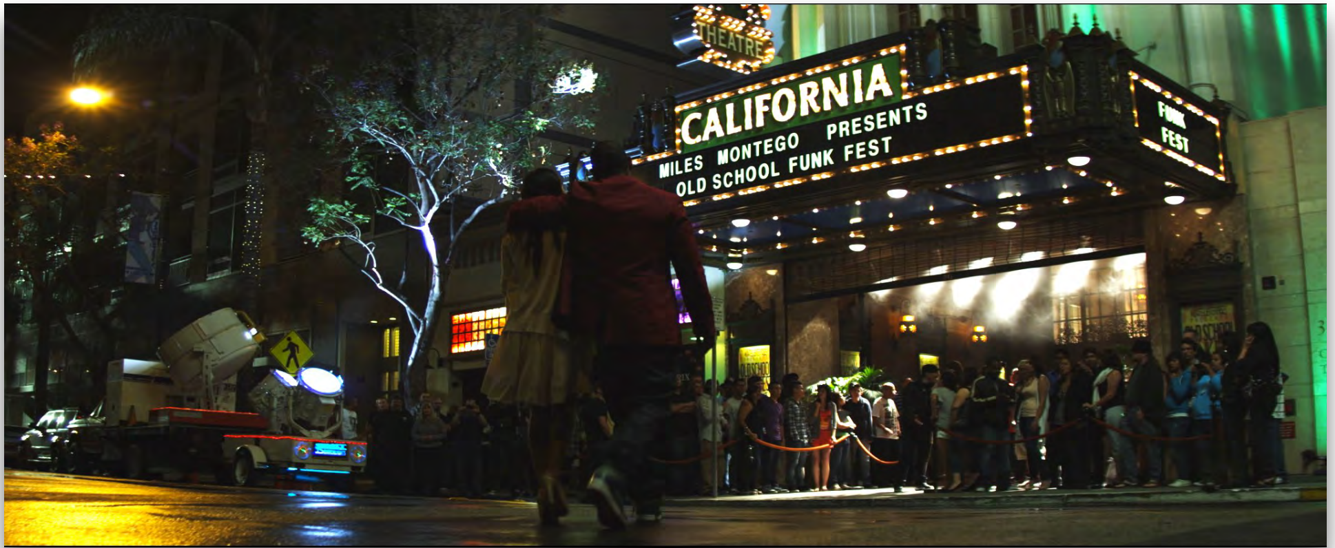
I'M IN LOVE WITH A CHURCH GIRL