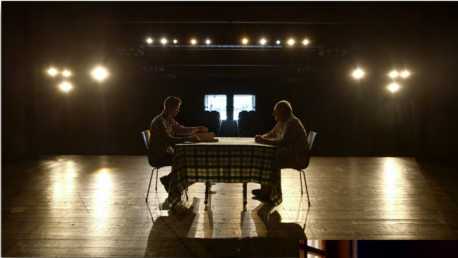
THE FATHER AND THE BEAR