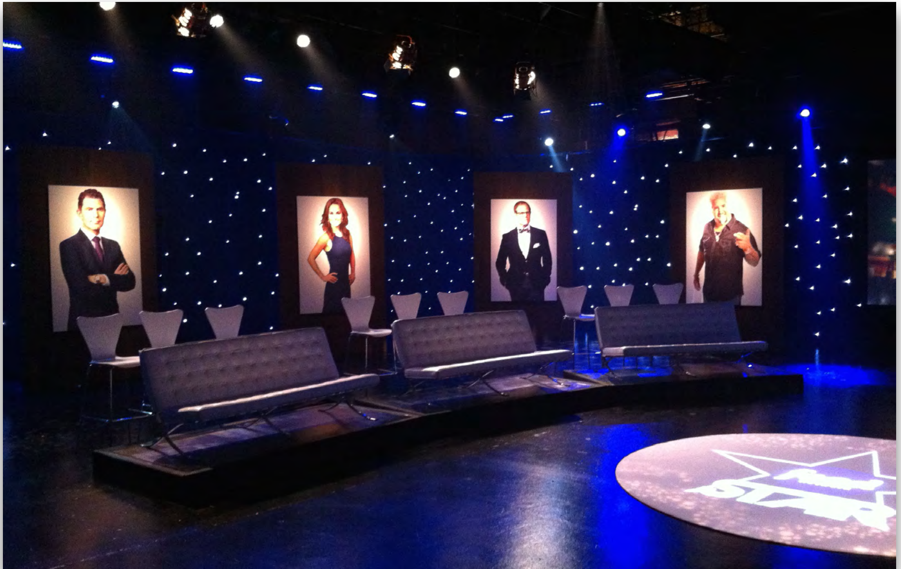
FOOD NETWORK STAR REUNION