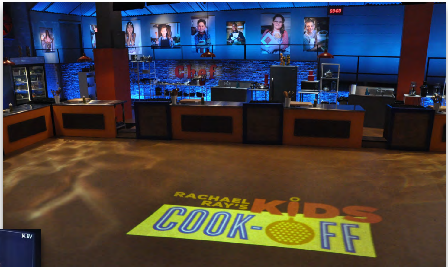
RACHAEL RAY'S KIDS COOK-OFF