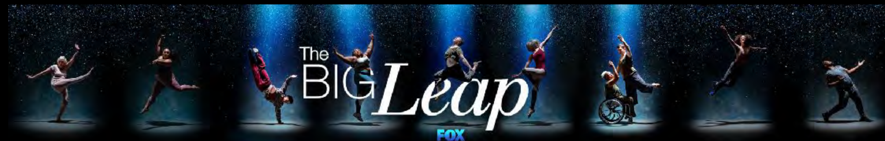
"THE BIG LEAP" CONCEPT WALL