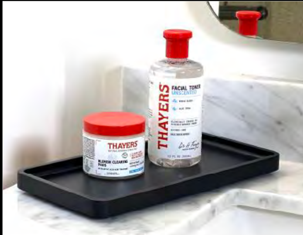
THAYERS "RESET" COMMERCIAL